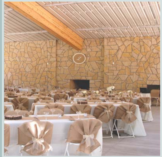
CATERING IS AVAILABLE AT ALL VENUES.