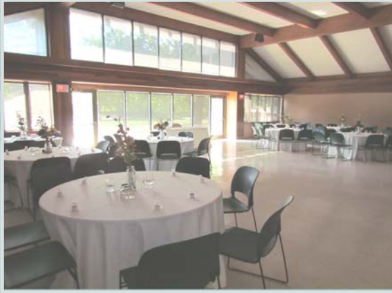
WIEDEMANN DINING HALL (LEFT TOP)